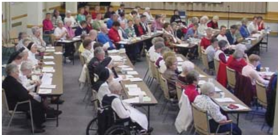
The Great Bend community assembled for the discernment day on the Cluster