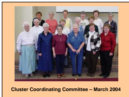
Cluster Coordinating Committee – March 2004

Leaders established a Cluster Coordinating Committee by the end of 2002. This committee planned a discernment process of seven cycles of meetings (congregational and inter-congregational) beginning in Fall 2003 and extending to the Spring of 2006. We had originally planned to have leadership present a final structure for decision-making at congregational chapters during the summer of 2006. However, as a result of recent congregational gatherings, Cluster leadership has decided to extend the timeline for decision-making to April 2007. This will allow more time for sisters to process the options for reconfiguration at congregational and pre-chapter meetings. (CLICK)